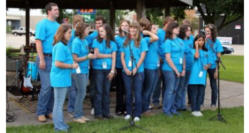
FBC Temple, TX brought Youth Choir to Muscoda for concerts & block party with Blue River Valley & Heartland (below).