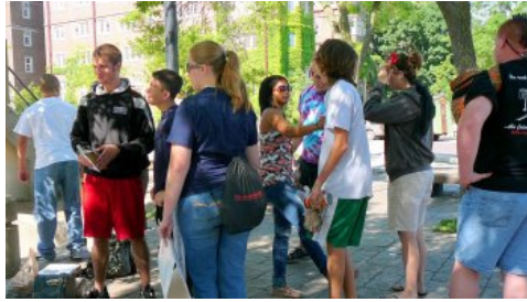
Miller Heights of Belton, TX sang, served breakfast & prayed at Library Mall with Red Village Church (above).