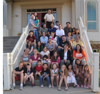
United Hmong of Sun Prairie has first VBS with FBC Hartsville, IN (on left).