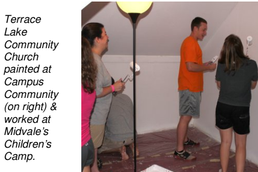
Terrace Lake Community Church painted at Campus Community (on right) & worked at Midvale's Children's Camp.