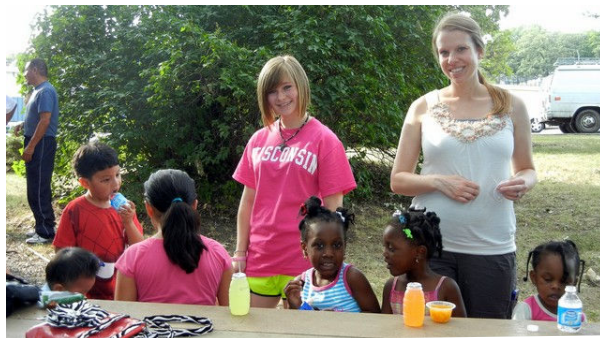
Texas Mission Team from Miller Heights serving refreshments at Hope in Christ Assembly VBS