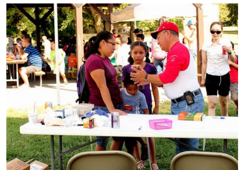
GCCBA team member sharing EvangeCube at Eagle Heights Block Party, sponsored by Brotherly Love International Church