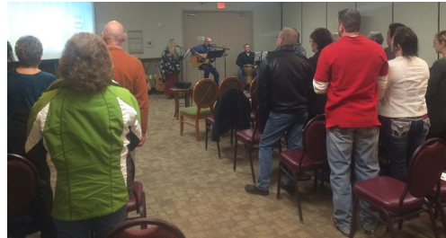
Services at Rock of Hope Church, Wisconsin Dells